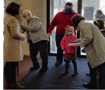
Volunteers welcome and assist with COVID protocols.