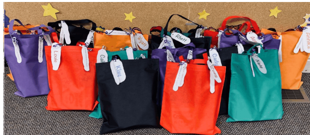
K of C purchased supplies for Sunday School Kits assembled by teachers.