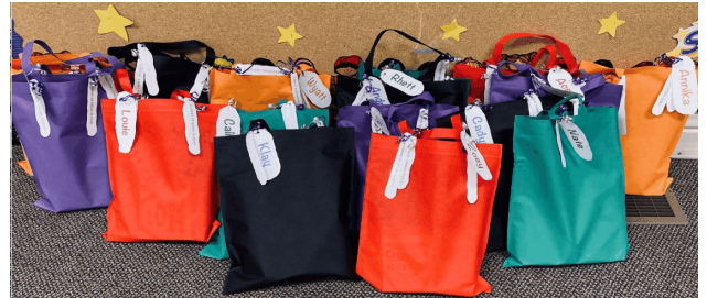
K of C purchased supplies for Sunday School Kits assembled by teachers.

General Fund contributions support FAITH IN ACTION