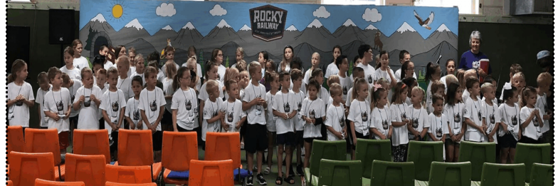
St. Francis was blessed to have 93 children participate in our Rocky Railway VBS program.

The General Fund contributions enables FAITH IN ACTION