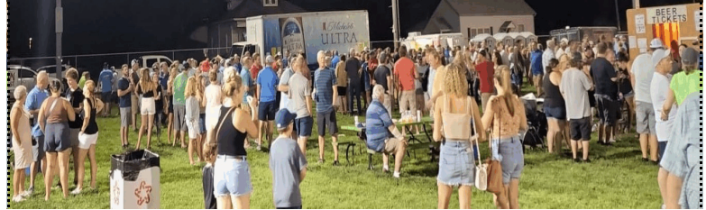
St. Francis Church Picnic 2022. Bringing the community together. Faith, family, friends, food & fun!

The General Fund contributions enables FAITH IN ACTION