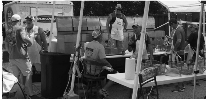
St. Francis Church Picnic 2022. Bringing the community together. Faith, family, friends, food & fun!

The General Fund contributions enables FAITH IN ACTION